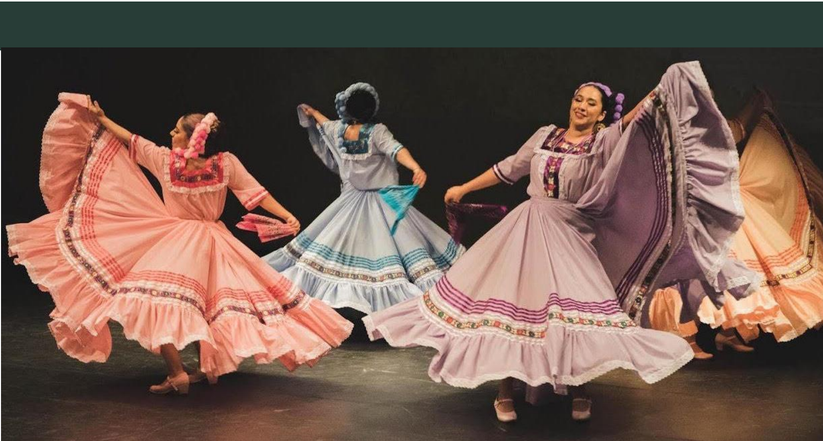
of Ballet Folklórico, a CCWC grant recipient